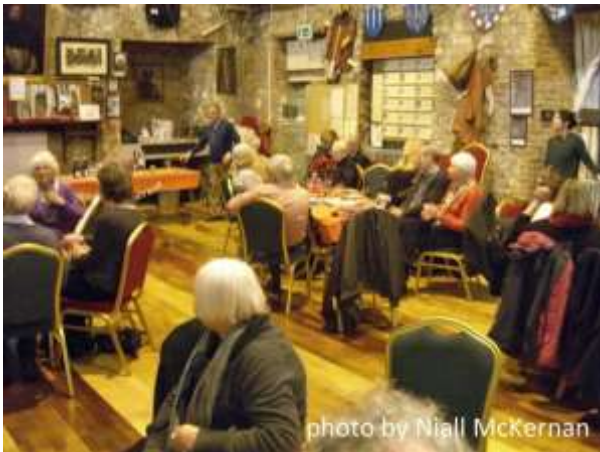
Some of the members