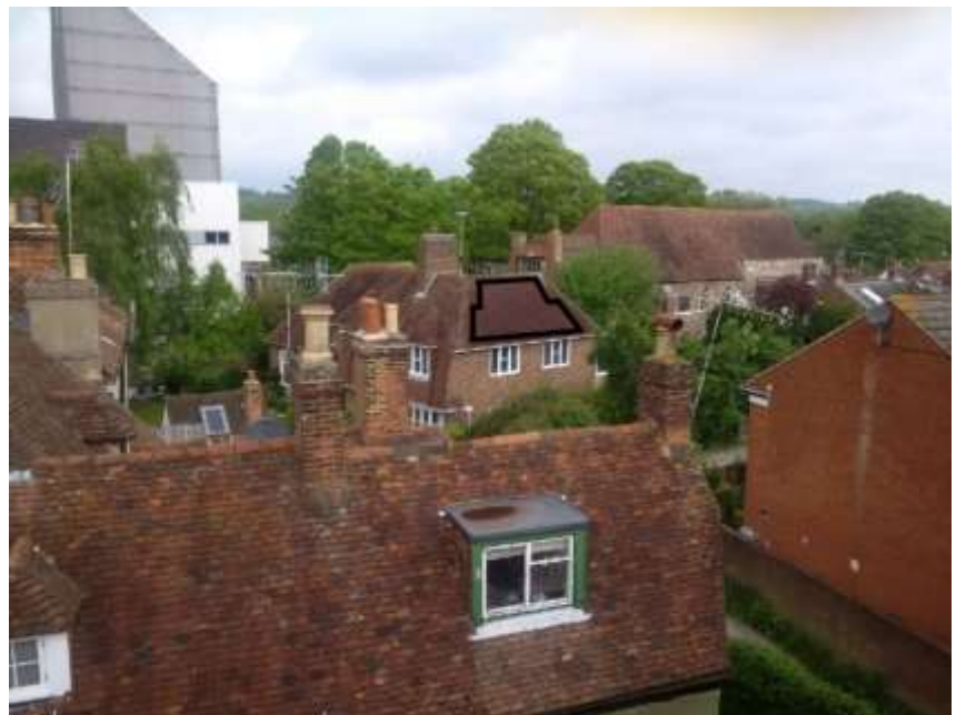
The black lines show the outline of the solar panels: there would be three other less visible panels as well