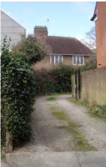
There is a clear view of the roof from King Street

There is a planning application to install 11 solar panels on the east-facing roof of the Friends' Meeting House. In the application it is claimed that the panels would be hardly visible, but the first photo shows that they would be clearly visible from King Street, and the second shows the unfortunate effect the panels would have on the roofscape of this conservation area. The panels would be black and shiny. There have been objections from six individuals, from the SPRA and from the CHDF (Canterbury Heritage and Design Forum – formerly the CCAC).