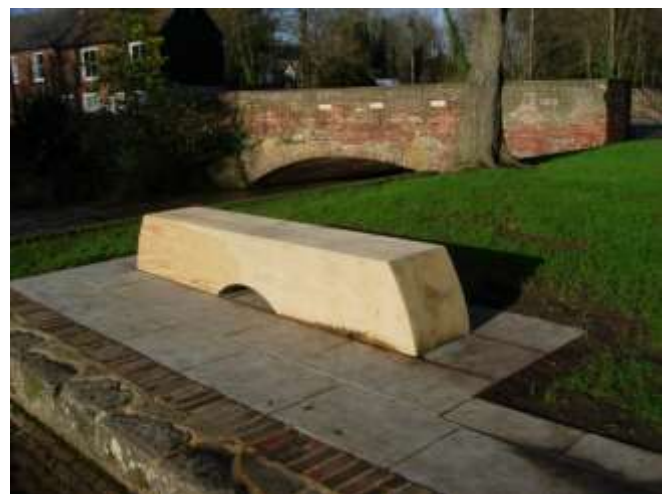
Abbot's Mill Garden